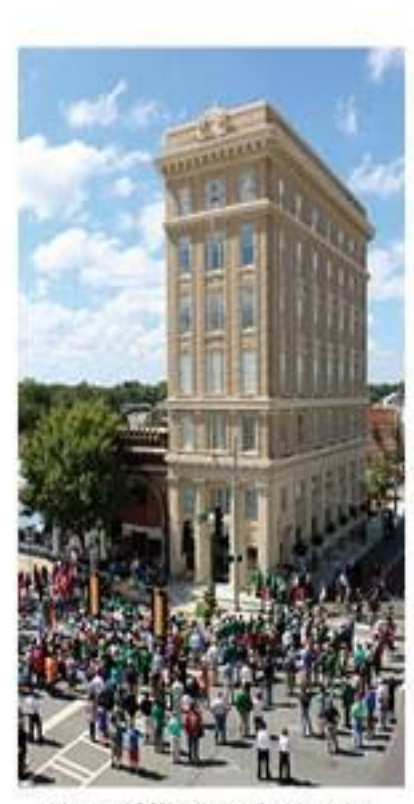
GMC Dublin Extension Center

The Zebulon extension center is the newest of the four GMC campuses in the Atlanta Metropolitan Region and provides courses for GMC students in Pike County and surrounding areas. The center is located in the Zebulon City Hall facility adjacent to Zebulon City Park at 7818 Highway 19 South. Open for postsecondary classes in March 2018, this campus offers GMC students the opportunity to complete classes toward an Associate or Bachelor of Applied Science Degree. Zebulon students, faculty, and staff have full access to library resources from the main campus and are supported by the Atlanta Metropolitan Regional Library Associate. Additionally, the Atlanta Metropolitan Region's Global Online Services Guide provides students detailed instructions on GMC's myriad of free 24/7 online services including cloud-based printing, catalogs, guides, databases, eBooks, and other research tools and resources.